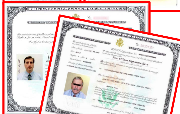
US Certificate of Citizenship or Naturalization