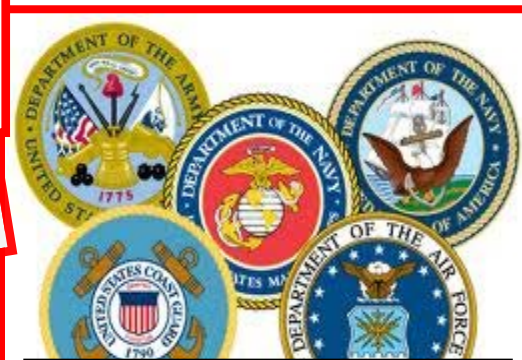
United States Military Identification